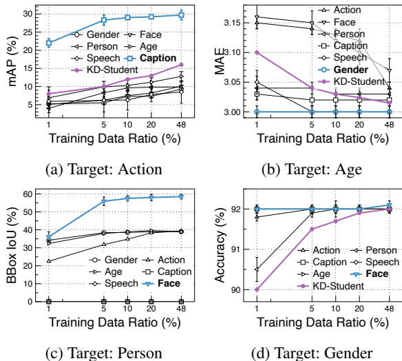
Figure 2: Performance of model links from different source models on four targets. KD-Student: student model trained via knowledge distillation on the target model.